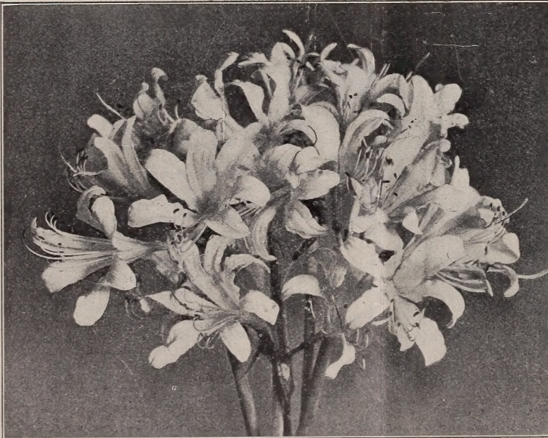
Lycoris Squamigera (Magic Flower.)

Price reduced to 75c. per doz.; $6.00 per 100; $50.00 per 1000.